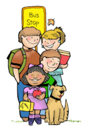
Good luck this year to all our school aged children and teachers.