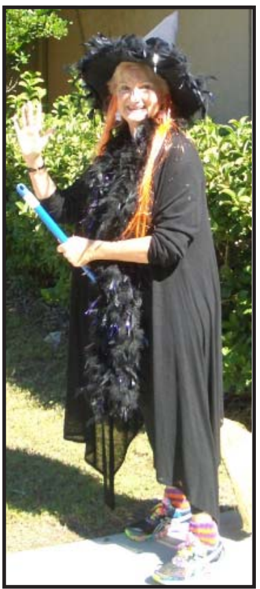
Our loving witch checking to make sure everyone is having a good time.