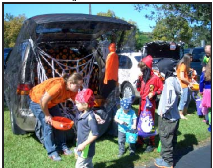
Ready to serve the Swamp Juice.