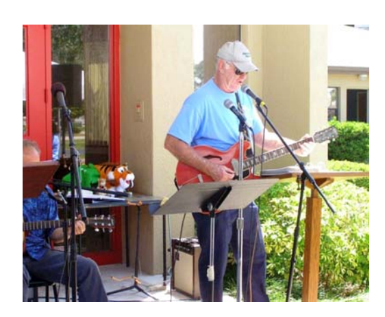
Church family members shared their instrumental music...