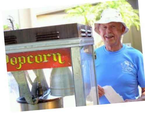
Food and snacks were shared...