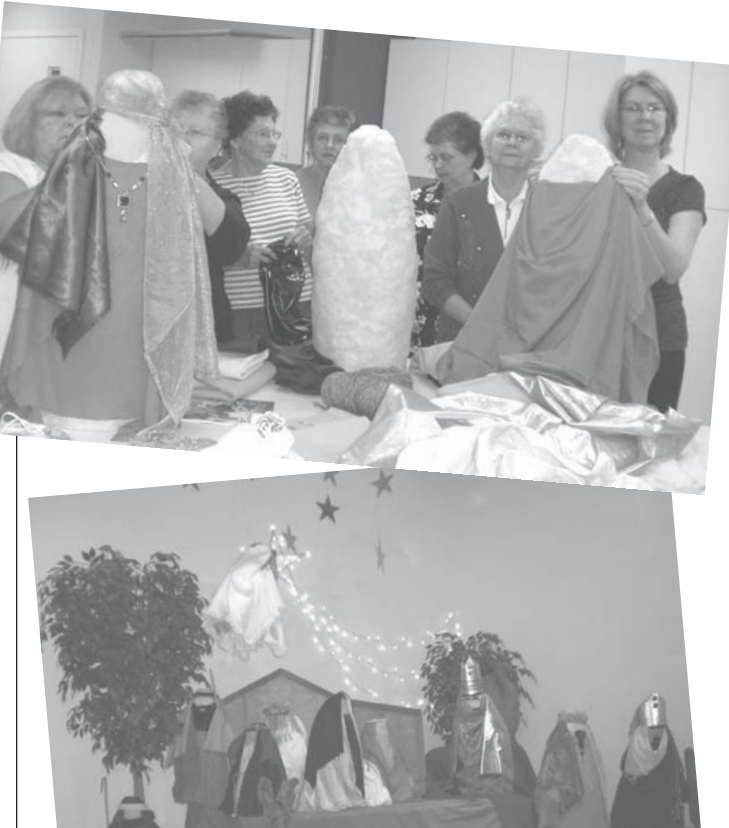
The above photo shows the complete nativity scene as created by those mentioned in the article.