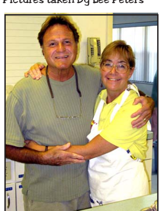
Two friends who came to help as a thank you because of the kindness they were shown.